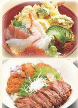
Seafood rice bowl, BBQ, etc.